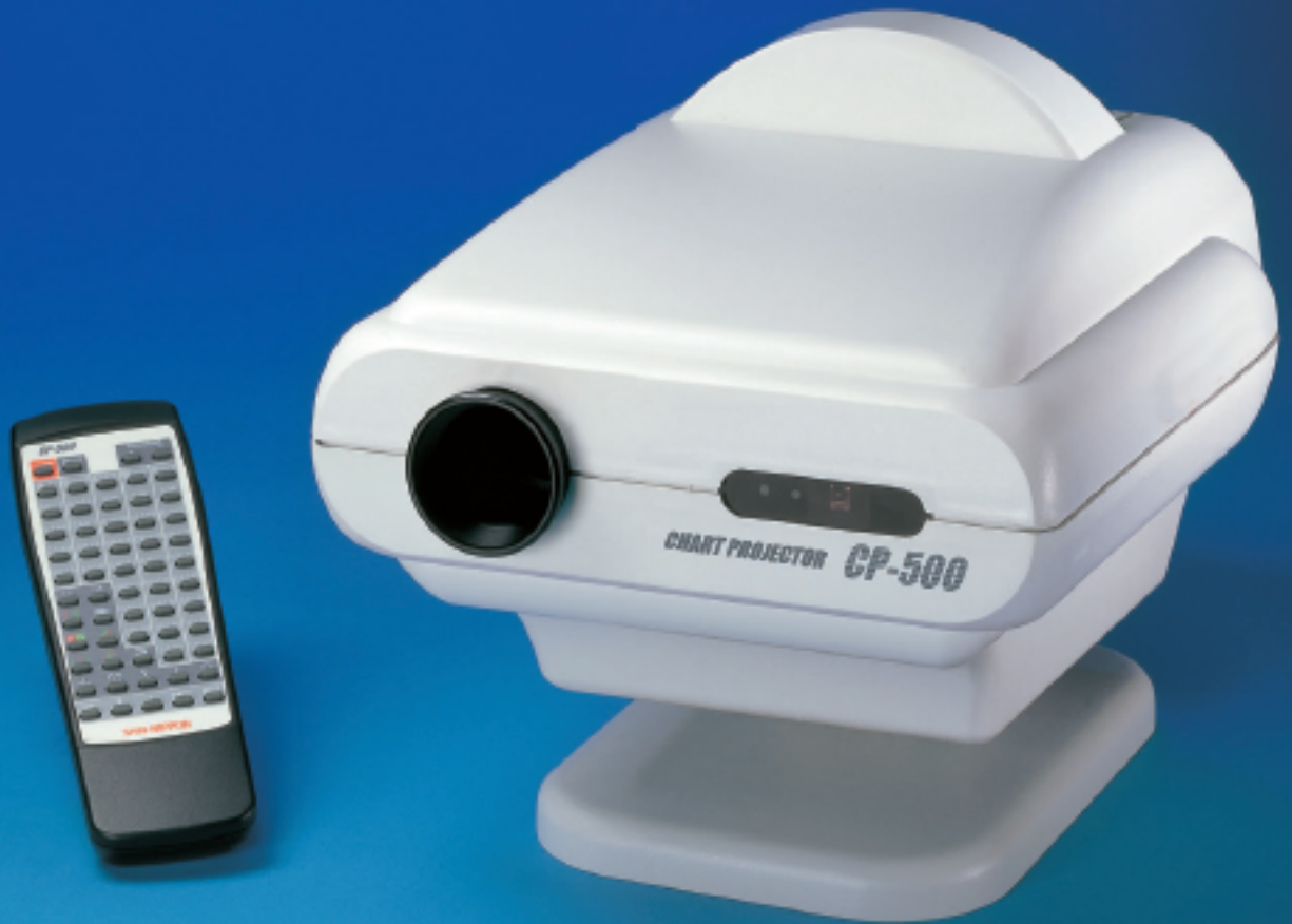
CHART PROJECTOR CP-500